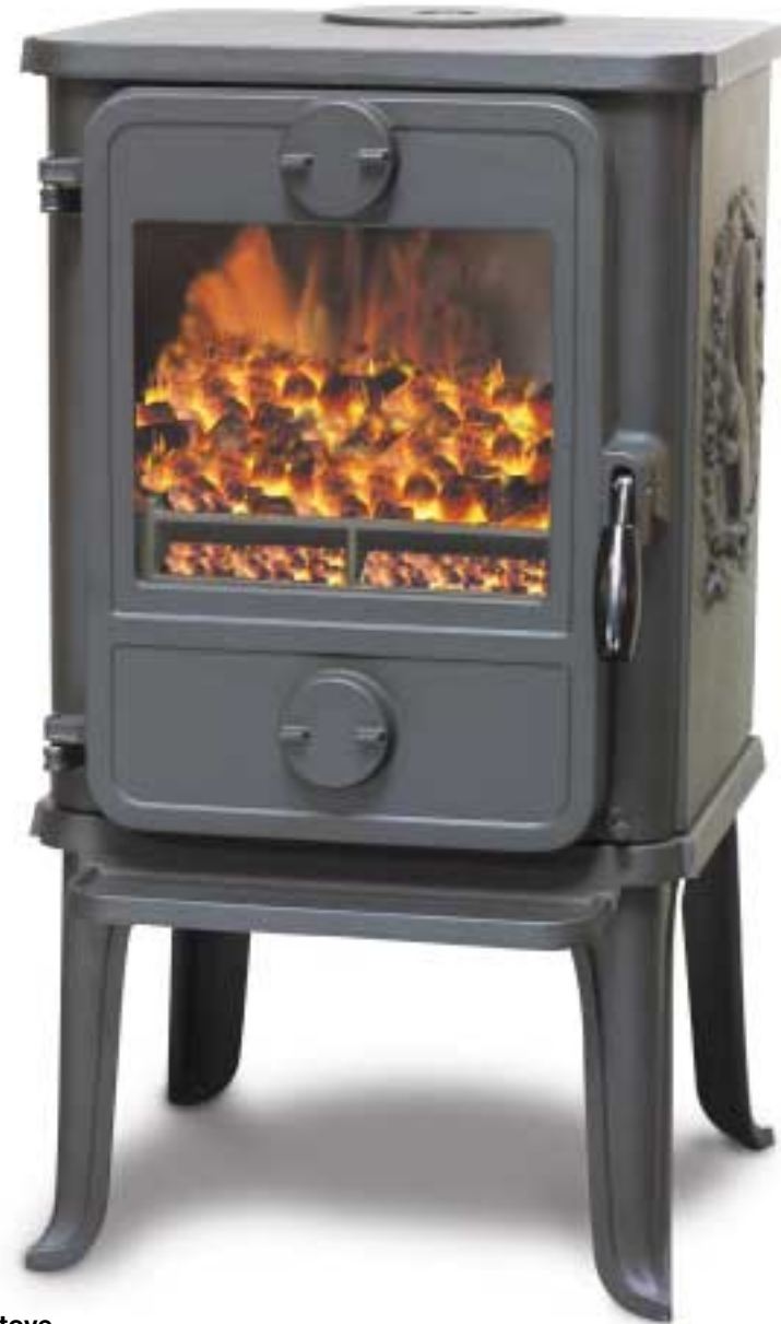
Morsø 1410 Coal Stove