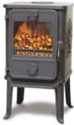
Morsø 1410 Coal Stove